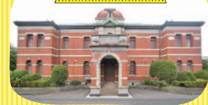
World Heritage Site Imperial Steel Works, Japan First Head Office / approx. 30 mins by car