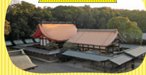
Munakata Taisha "Michi no eki" Munakata approx. 20 mins by car