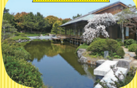
Ashiyagama no Sato approx. 20 mins by car