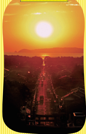
Miyajidake Shrine Path of Light approx. 30 mins by car

Conveniently located near these great tourist attractions!